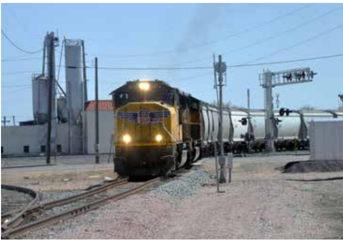
The UP crew out of La Salle takes cars to the Great Western at least 3 days a week. Here the train has left the main at the Greeley Junction wye and is entering GWR trackage.

But if you do see a train slowly heading north by the museum with many sand and lumber loads, chances are it is headed for the interchange. You might find it interesting to follow it across town.