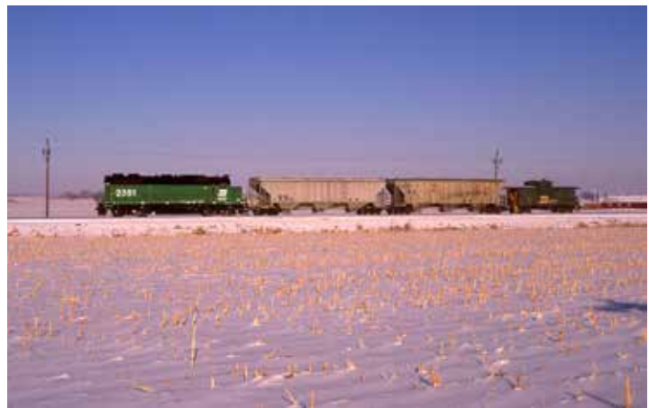
Burlington Northern served Windsor at least 5 days a week, but only occasionally ran all the way east to Greeley. When they did, they usually had just a couple cars. They still used a caboose since the connection trackage in Fort Collins required a backup move across busy streets at the time.