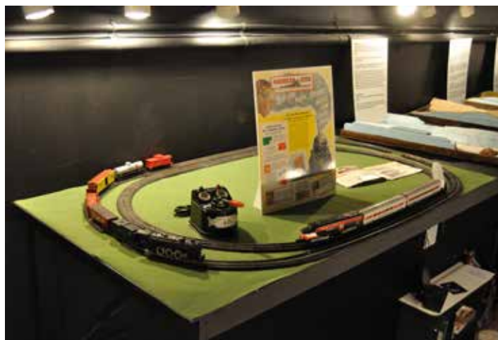
The museum's American Flyer exhibit simulates the type of layout possible in a 4' x 8' space. With two loops of track, this could keep a child entertained for hours.

By the 50's the use of plastics was common, simplifying the manufacturing of rolling stock. The locomotive mechanisms