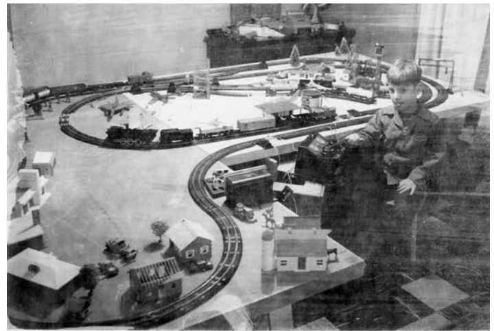
The author, in a photo dated December 1963, is clearly proud of his trains and has supplemented them with a number of Plasticville U.S.A. structures and other accessories.

We often hear that "Toy Trains are valuable collectables." And indeed if you look at eBay or speciality collector services, there are always a number of items that are fetching high dollar amounts. They are items that are pristine and show little usage. But if you look at the mundane items like track or common freight cars, those items are selling for very low prices, if they sell at all. And items showing wear or need attention can't be given away.