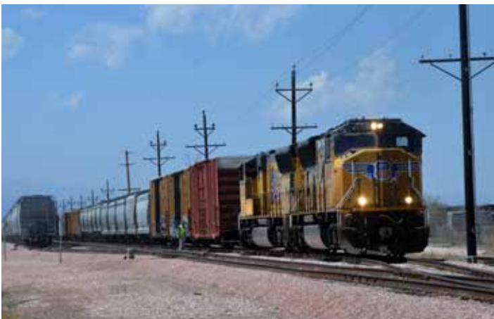
The normal interchange point is now at the GWR's 3-track yard at 35th Avenue and F Street in north Greeley. The UP transfer usually brings in a long cut of cars and leaves them on one track, then runs back to the east end to pick up the outbound cut. Hopefully the third track is empty!