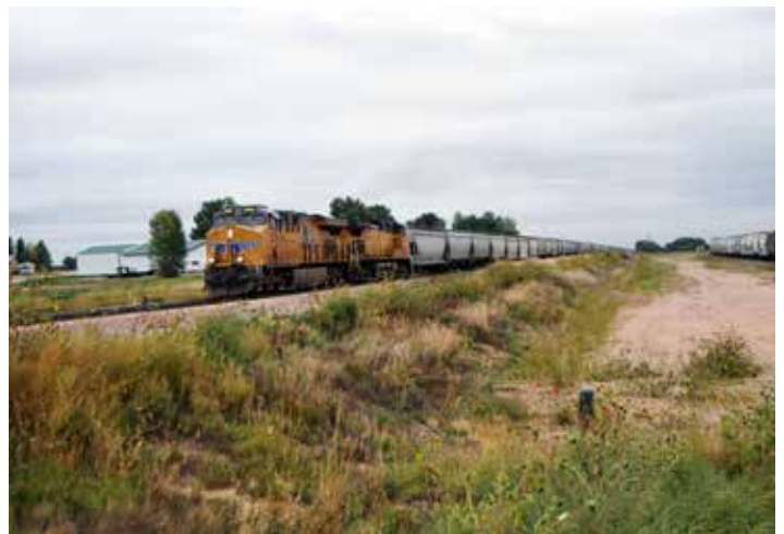
Occasionally a unit train of corn is destined for the ethanol plant at Windsor. The train is approaching County Road 23 3/4 on what looks like a high-speed double track main line.